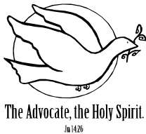
The Advocate, the Holy Spirit. Jn 14:26

EUCCHARIST AT OUR LADY OF THE ASSUMPTION 7742 West Saanich Road, Saanichton Sundays at 8:30 am Last Friday at Saanich Peninsula Hospital at 11 am Remaining Fridays at 9 am in a private home (See "This Week in Our Parish" inside bulletin)